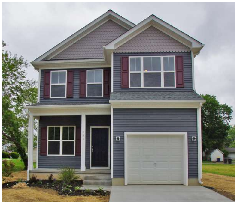
An example of a home built by NCALL in Central Dover.

Development Funds, also from DSHA, as gap financing. The project has also been generously supported by JPMorgan Chase, the Federal Home Loan Bank of Pittsburgh and Neighborworks® America, as well as by DSHA.