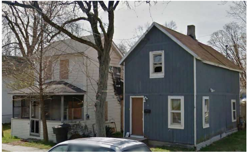
Two blighted homes purchased by NCALL and scheduled for demolition and redevelopment.

Redevelopment is very expensive involving acquisition, environmental testing and abatement, demolition, and finally construction. NCALL is grateful for the support received from its funders and partners. In 2017,